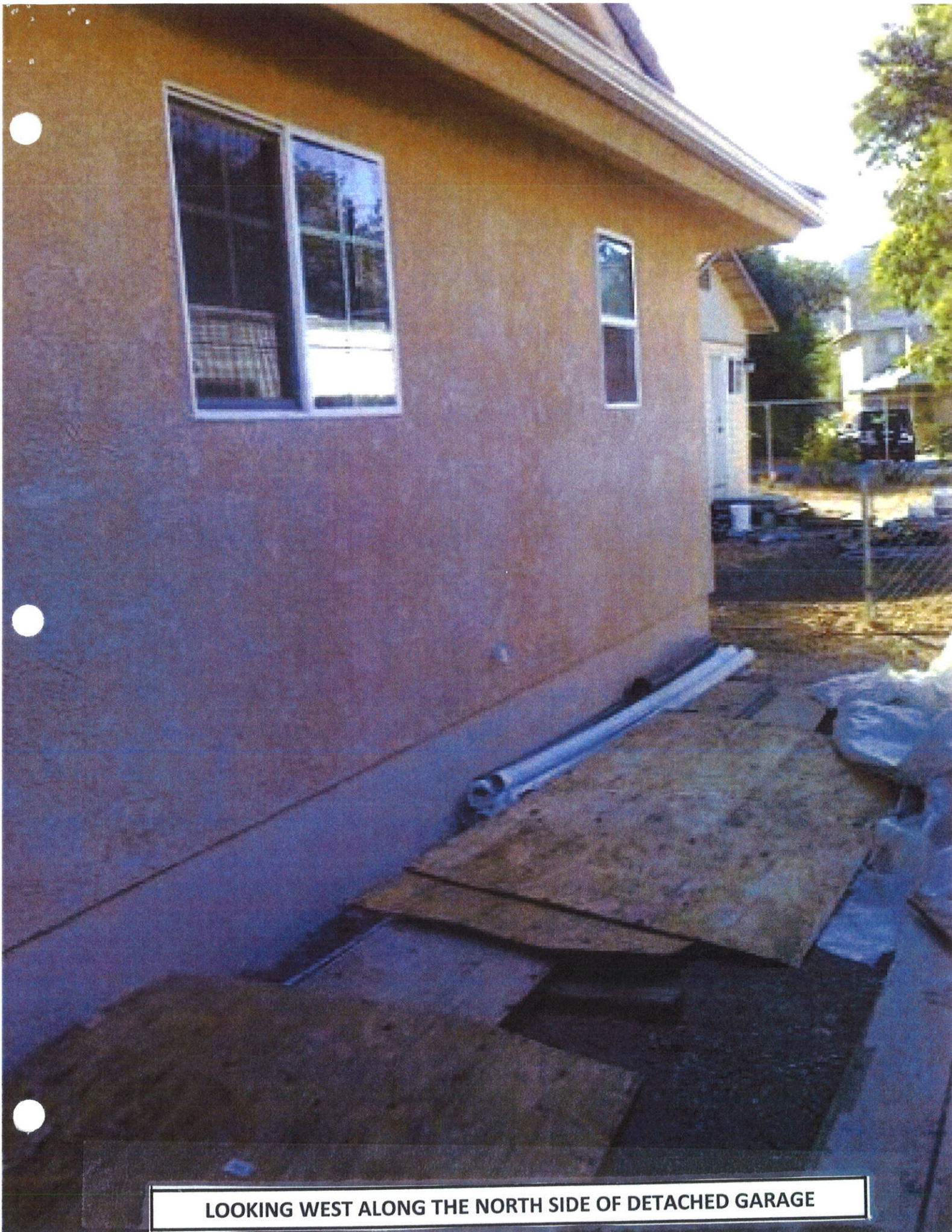
LOOKING WEST ALONG THE NORTH SIDE OF DETACHED GARAGE