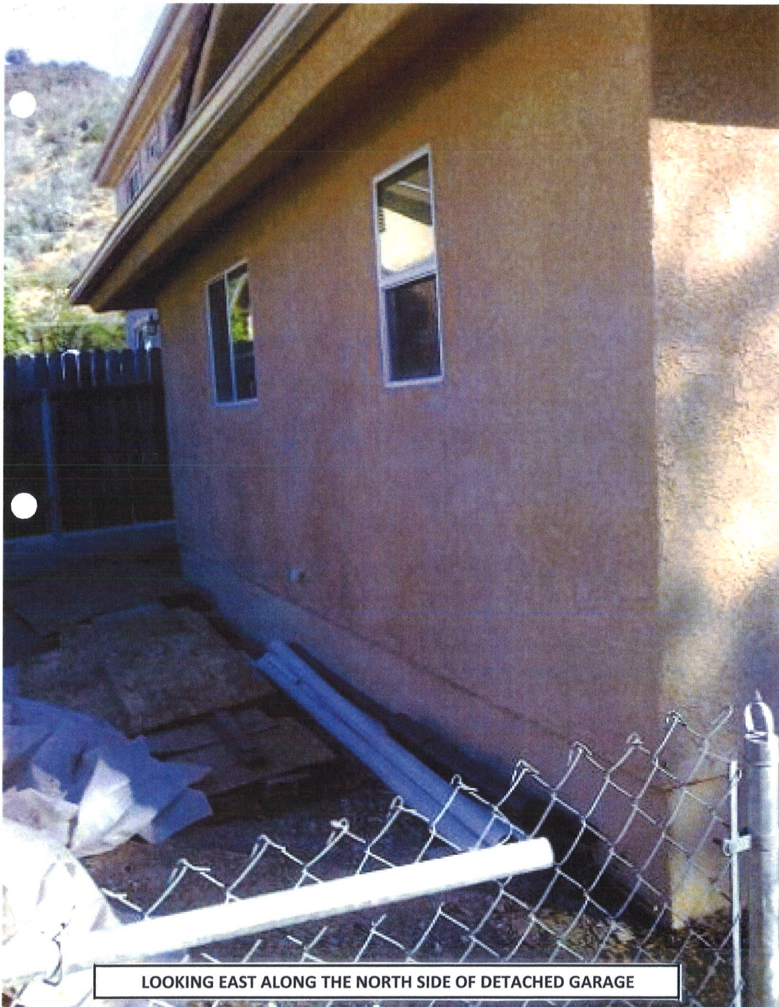
LOOKING EAST ALONG THE NORTH SIDE OF DETACHED GARAGE