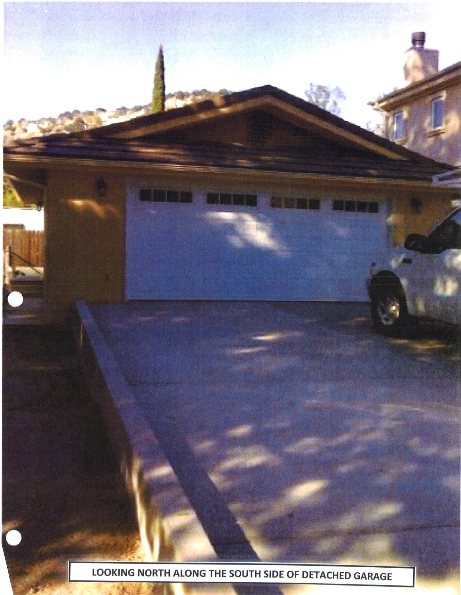
LOOKING NORTH ALONG THE SOUTH SIDE OF DETACHED GARAGE